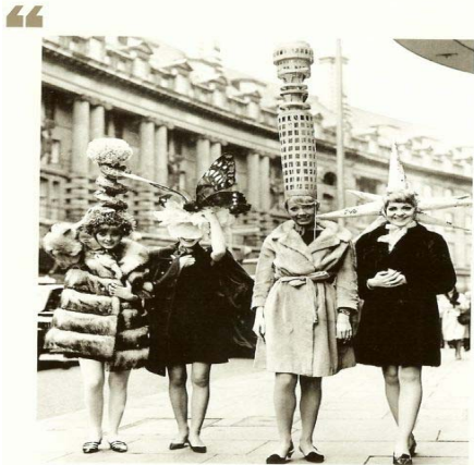
My goal is to do something outrageous every day. Maggie Kuhn (1905-1995)

I hope you like the photo. It sums up my philosophy of faith. The caption reads, "My goal is to do something outrageous every day." I received this photo from my aunt right before I left to go to Uganda on a mission trip. This was a big step of faith for me but God equips those he chooses, right? Anyway, I signed up and then immediately began to have anxiety attacks about being on a plane for so many hours. I would just rather be strapped to the wing, if I had a choice; I'm claustrophobic. For weeks this went on and finally, God was faithful and gave me Matthew 8:26 where Jesus tells his disciples "You of little faith, why are you so afraid." Well, it was a moment for me, kind of a "duh" moment, if you really want to know. God telling me just like the twelve, "how much more do you need to see to believe?" As the days grew closer to our departure, I prayed harder and God continued to reveal his grace to me. Do you know that there are 366 scriptures on fear! One for every day of the year plus one for leap year! I got His message from Scripture, from my own prayer time, from others praying for me, from the book